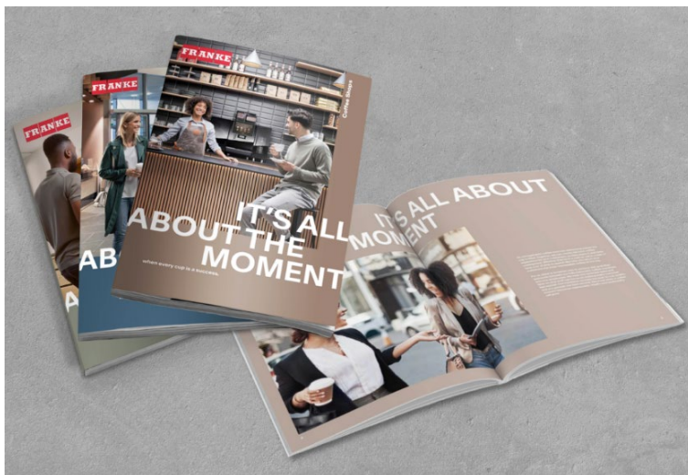
Caption: Franke Coffee Systems' brand image comes to life in a fresh, contemporary design

Surfing through specific products and targeted Franke Coffee Technologies, the users of the new website coffee.franke.com embark on an interactive journey to discover how Franke transforms changes into opportunities.